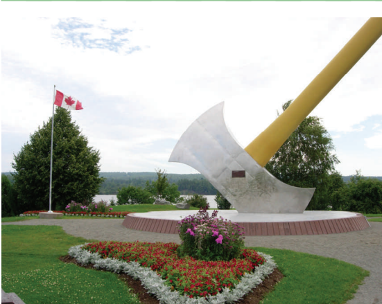
World's Largest Axe at Nackawic