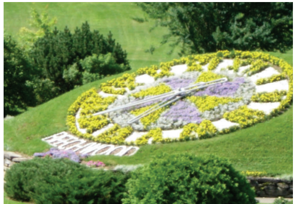
Floral Clock at Beechwood Hydro Dam