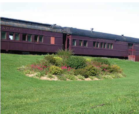
Railcars 2006– Before Restoration

The Village of Bristol is active in the construction and renovation of the Shogomoc railway station and three cars located on Main Street, Bristol. The Shogomoc Railway Club and the Village of Bristol have partnered with assistance from the Federal government through the Innovative Community Fund , to restore and renovate the station and cars.